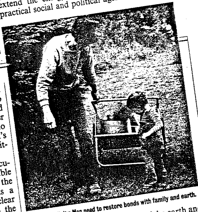
Eco-masculinity: Men need to restore bonds with family and earth.