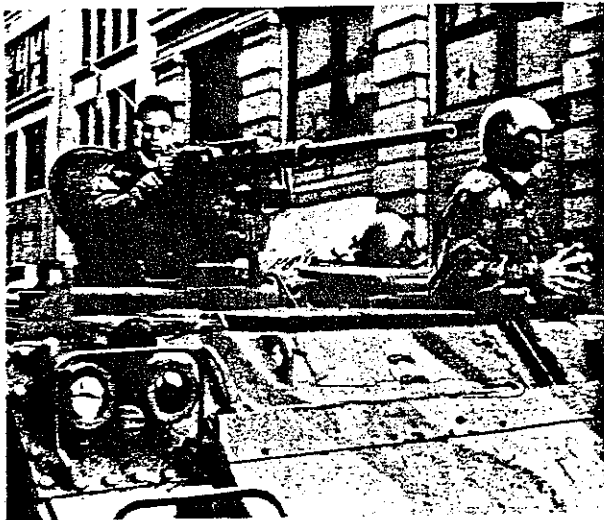
Way of the warrior: True masculinity is deformed by militarism.

As the primary victims of mechanized war, men must oppose this continued slaughter. Men need to realize that the traditional male concepts of the noble warrior are undermined and caricatured in the technological nightmare of modern warfare. Men must together become prime movers in dismantling the military-industrial establishment and redistrib-