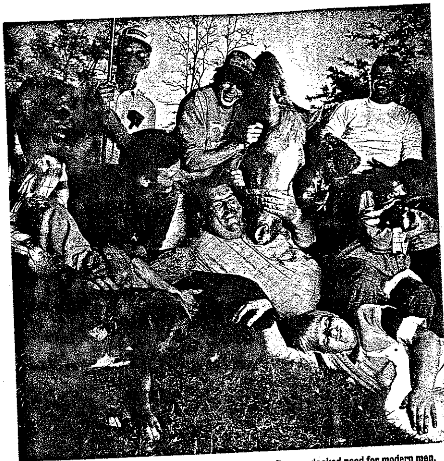
Bless the beasts and the buddies: Male friendship is an often overlooked need for modern men.

uting defense spending toward a sustainable environment and protection of family, school, and community.